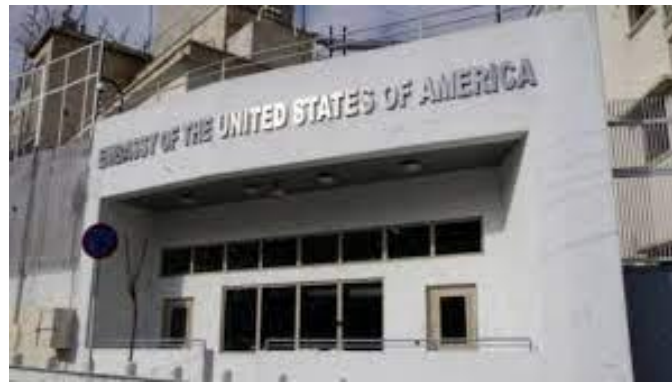
Figure 2. The United States Embassy Building, Lagos – LEED Certified; Source: Author's Personal Collection

Only 35% of respondents, as revealed by the quantitative data, had actually employed green building rating systems in their projects, but 60% had heard of them. This is illustrated in Figure 1. The most widely utilized rating systems were LEED and BREEAM, and the most frequently mentioned advantages were increased indoor air quality, water conservation, and energy efficiency. However, the main obstacles to their widespread adoption and execution were noted as being high costs, a lack of technical competence, and cultural and societal hurdles. Figure 2 illustrates the United States of America's Embassy Building in Lagos, Nigeria as an example of a LEED-Certified building in the study area.