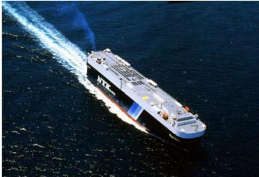
Cargo ship directed by solar panels