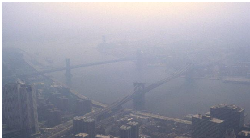
Figure: 4 Smog in New York City as viewed from the World Trade Center in 1988(4)