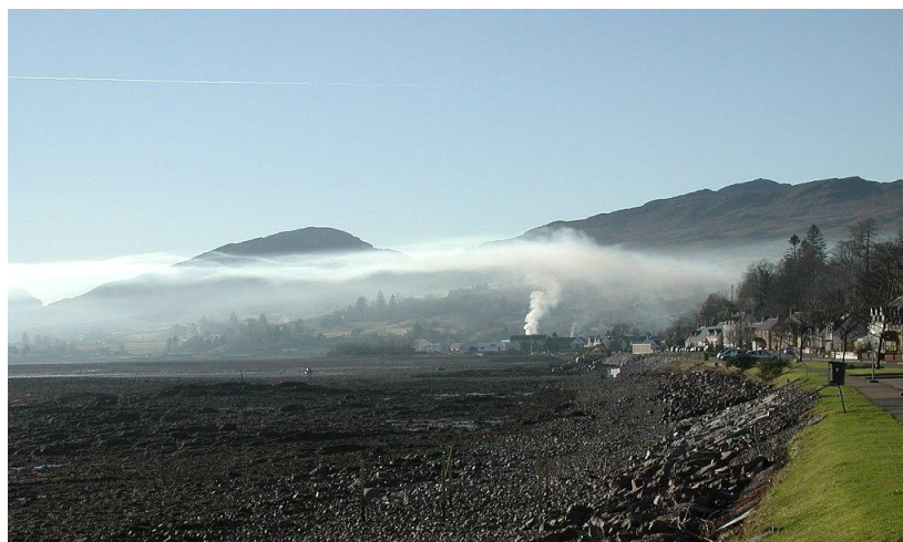
Figure 3: Smog over Donora

A typical photo of Donora with dangerous smog is shown in figure 3.