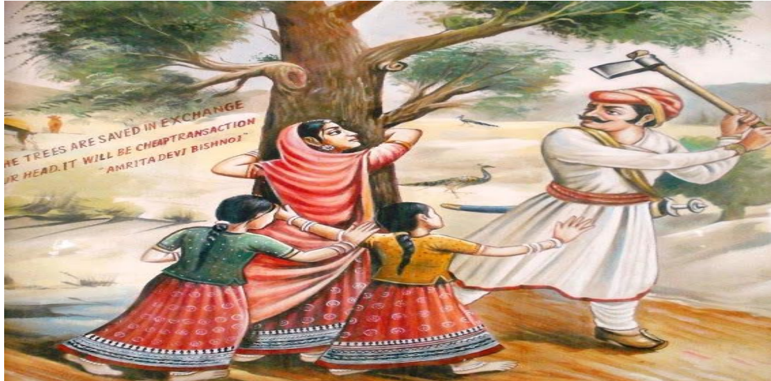
Figure 10: A painting that describes about the Massacre (10)

When the king heard about what his one order caused then he came by himself to apologize and vowed that in his reign no one would cut trees or animals. Chipko movement in 1970's was also inspired by this Khejri Massacre.