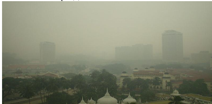
Figure 7 Smoke engulfing the country capital, Kuala Lumpur(7).

Figure 1.7 shows smoke over Kuala Lumpur(7).