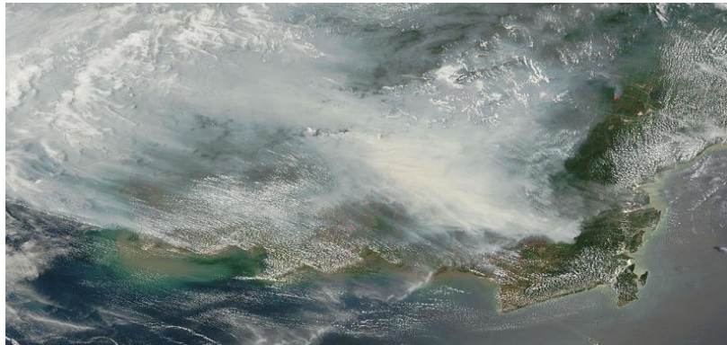
Figure: 8 Satellite photograph of the haze above Borneo(8)

Burning of Slash is common among farmers as it is quite cheaper than any other alternative. In Indonesia, a haze that affected many countries like Malaysia, Singapore, Thailand and even South Korea, which was a result of continuous burning of slash and cultivation, in 2006. This caused toxic pollutants in the air and poor health of people living in urban areas(7).