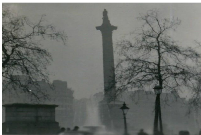
Figure: 5 Nelson's Column during the Great Smog of 1952(5)

December 5 th to 9 th , a severe air pollution episode took place in London. High concentrated air pollutants formed a thick layer of smog with the cold weather and calm wind condition. Like the other smoke incidents in history, this thick layer of smog which caused disruption in visibility and respiration, was also caused by air pollutants from burning of coal. By December 8 th 4,000 people died due to smog. 100,000 people reported illness related with respiratory system. Even after these 4 days the fatalities was continuously rising and it rose up to 6000 in the following month. Although this incident was worst air pollution event in history of U.K. yet suffering from air pollution isn't any new for London, since 13 th century it is suffered from its poor air quality which was highest in 16 th century. But later London worked on its policy towards environment in 19 th century (5).