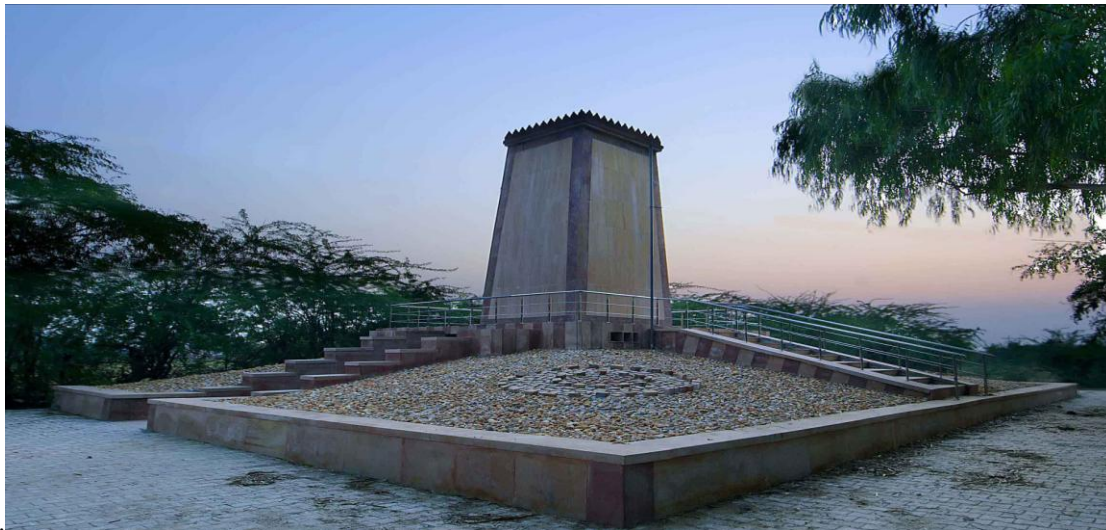
Figure 11: Memorial of 363 martyrs in Khejri (11)

When the king heard about what his one order caused then he came by himself to apologize and vowed that in his reign no one would cut trees or animals. Chipko movement in 1970's was also inspired by this Khejri Massacre.