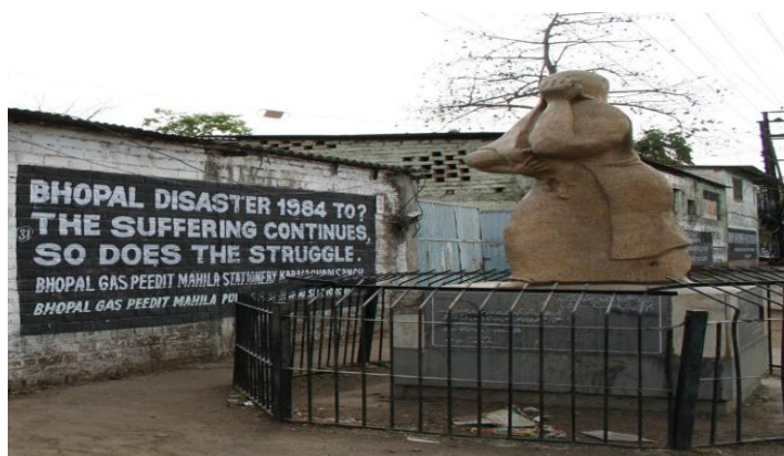
Figure: 9 Memorial by Dutch artist Ruth Kupferschmidt for those killed and disabled by the 1984 toxic gas release

It wasn't just the worst tragedy of India but all over the world. Near about 500,000 people were exposed to the highly toxic gas. This gas caused 3,787 deaths and 558125 injuries. But soon it was estimated that 8000 or were died within two weeks. It was a result of inadequate maintenance of stack, pipes which resulted in backflow of water into the Methyl Isocyanate Tank(9).