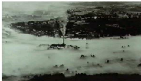
Air inversion results in 60 dead and thousands sick from exposure to industrial air emissions.